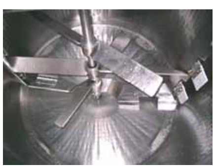
triple level pitched blade paddles combined with anchor impeller and scrapers