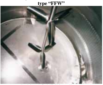
dual level fluidfoil impellers