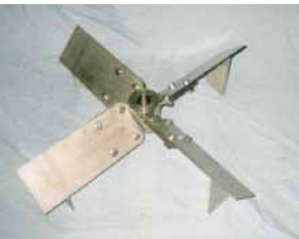
pitched blade turbine with stabiliser fins and bolt on blades