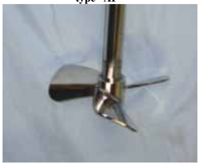
jet stream impeller usually with series 25 direct drive mixers type "JF"