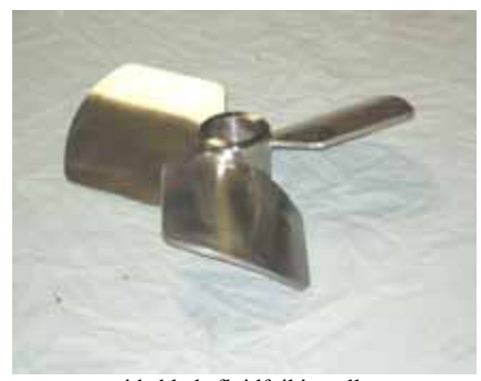
wide blade fluidfoil impeller for strong axial flow in medium viscosities

They can also be used in conjunction with radial flow impellers for specific applications.