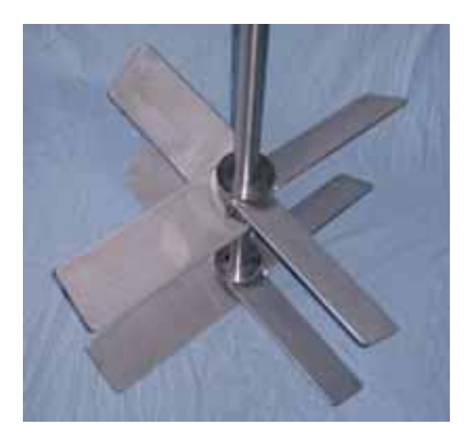
dual level pitched blade turbines